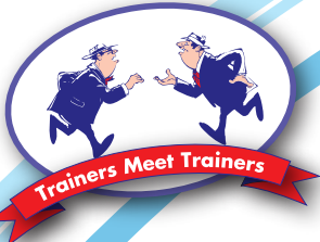
Trainers Meet Trainers

"Let's grow!" TMT becomes full day sessions and now there are more speakers. There is a fee, but low enough to allow many participants. 350 we thought, is a good number.