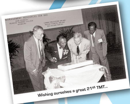
Wishing ourselves a great 21 st TMT...

The Asia HRD Congress is being held from 26 th to 28 th of July 2004 in Sunway Pyramid Convention Centre, Malaysia