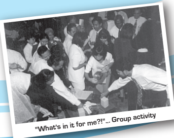
"What's in it for me?!"... Group activity