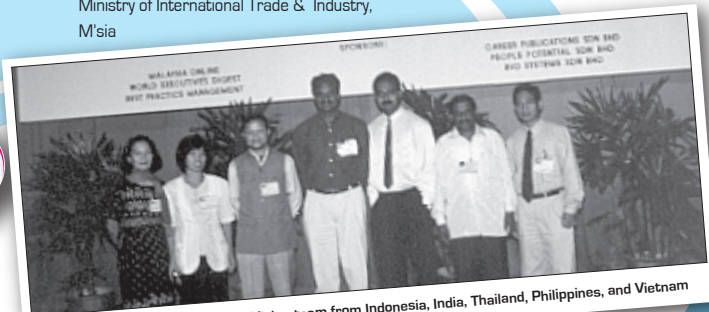
The faces of Asia - the World Vision team from Indonesia, India, Thailand, Philippines, and Vietnam