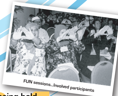
FUN sessions...Involved participants